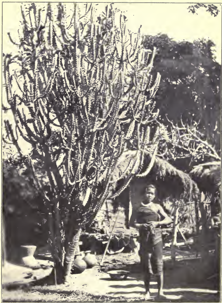
SIJV TREE ( Euphorbia splendens).