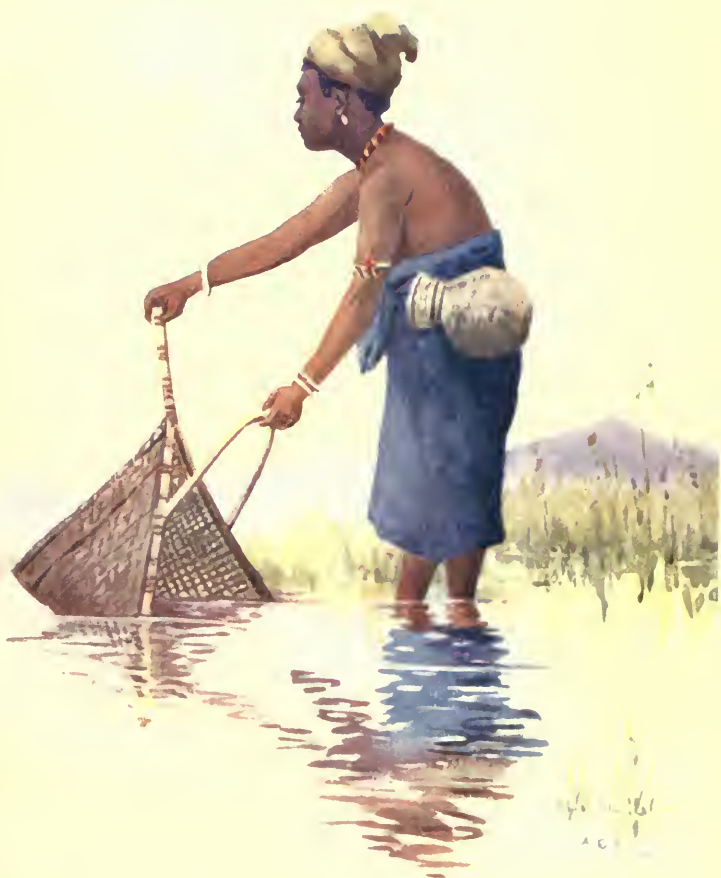
KACHARI GIRL FISHING