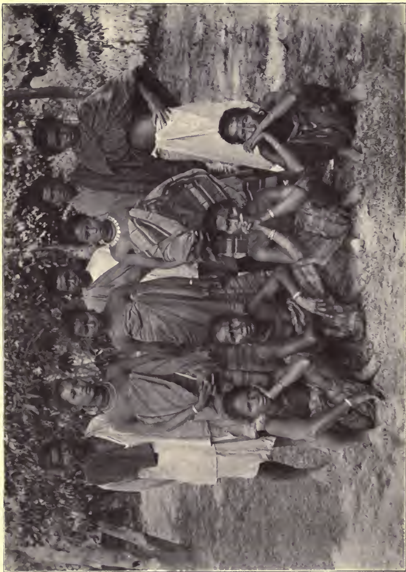
GROUP OF MECHEs (Gopalpara District).