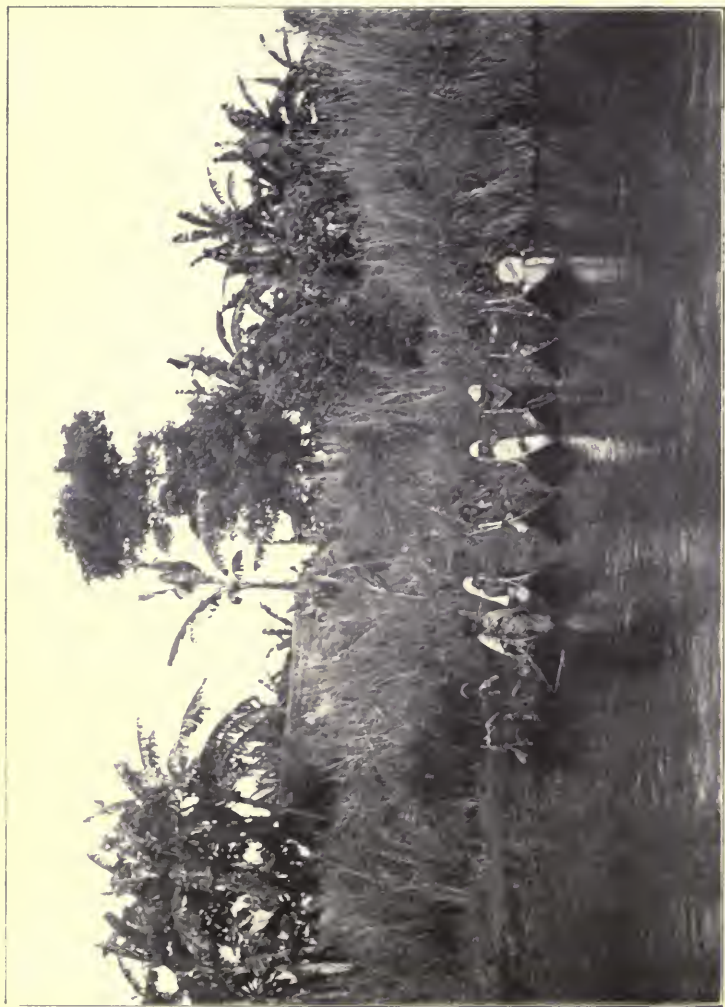
KACHÁRI WOMEN FISHING (Kamrup).