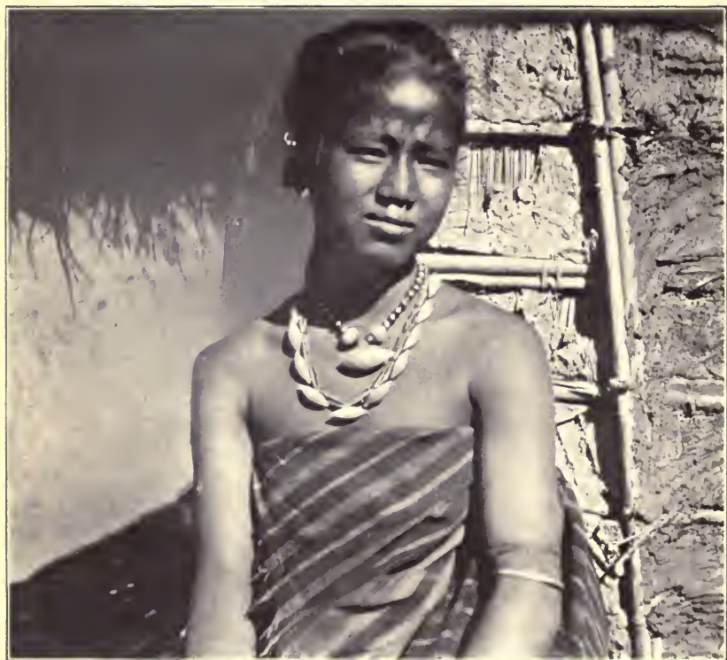
KACHÁRI GIRL. (Kamrup District).