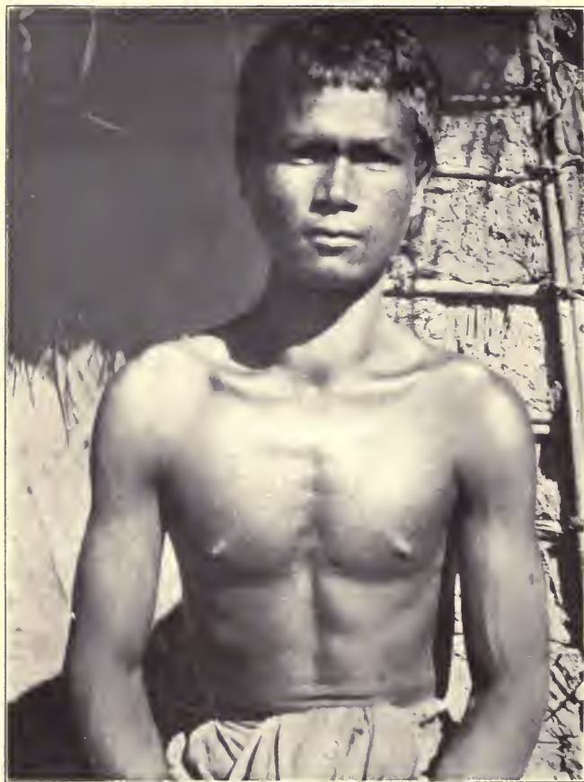
KACHÁRI MAN (Kamrup District).