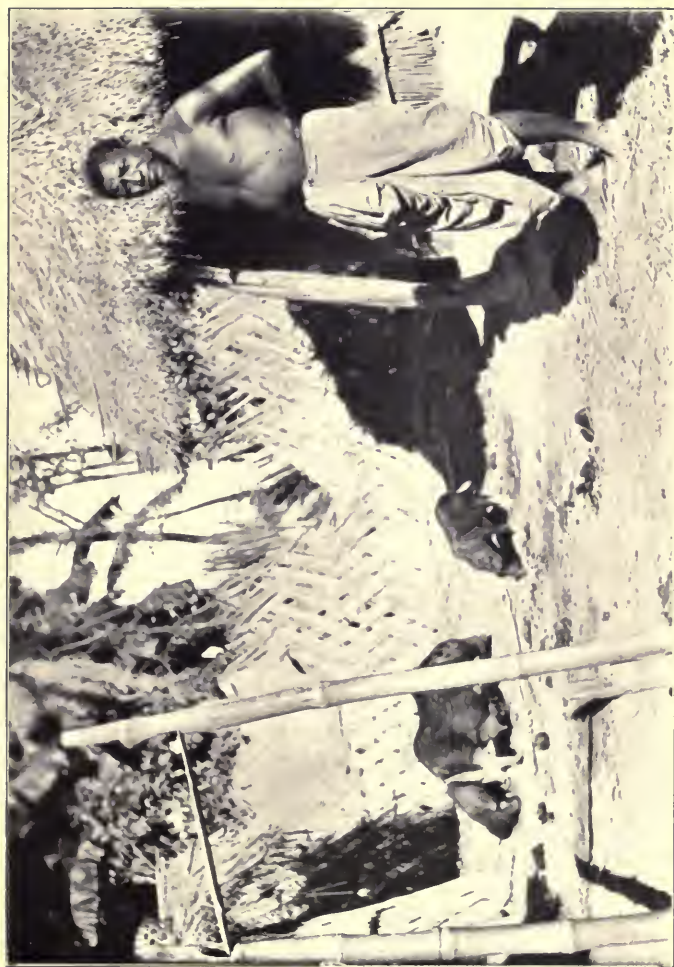
KACHARI VILLAGE INTERIOR (Kamrup District).