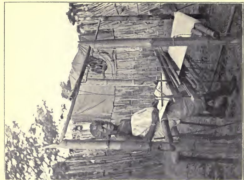
KACHARI WOMAN WEAVING (Kamrup).