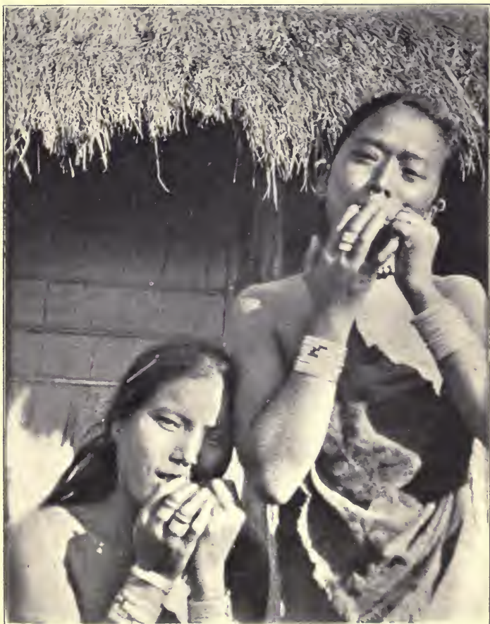
KACHÁRI GIRLS PLAYING JEW'S HARP (Gongina).