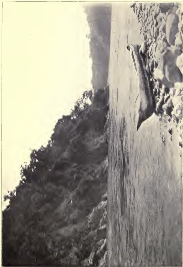
GORGE OF THE RIVER MANAS