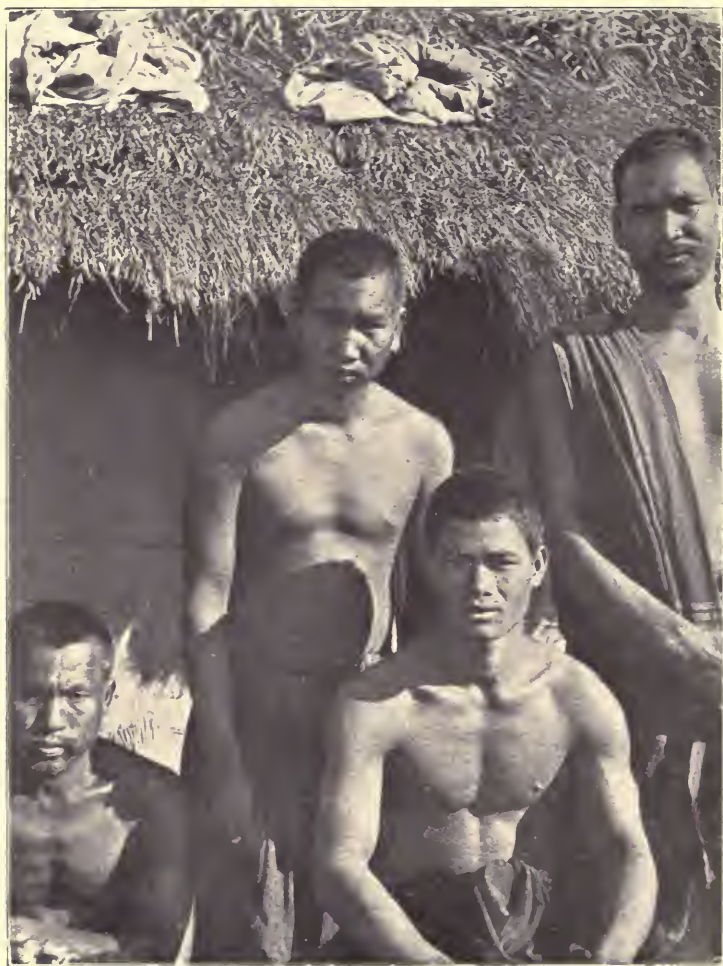
GROUP OF KACHÁKI MEN (Kamrup District).